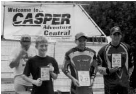
Third place at a National felt pretty good!