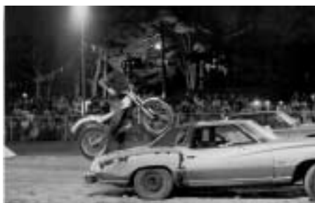
Riding his Yamaha TY350 in the Washington County Fair, circa 1986.

His first exposure to trials came from helping out the Rhody Rovers with the first US World Round in 1975. He had ridden some scrambles with a Honda