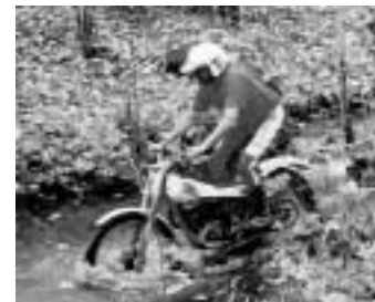
On the TY350 again. This shot was taken in Vermont in the late 1980s.